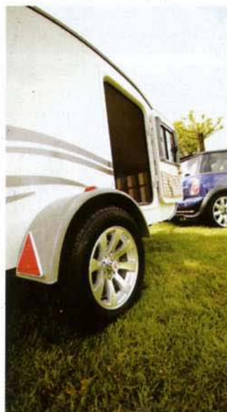
Reflective triangles sit on the alloys.