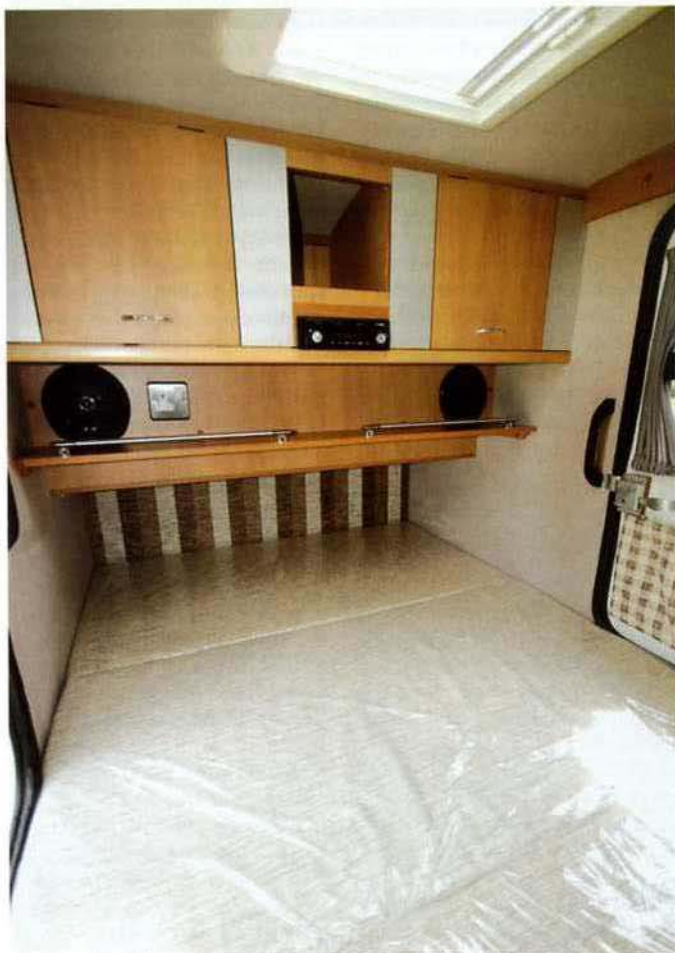
Mattress is split into three pieces on top of a lino floor.

And the fact that you can pull it with some of the smallest cars on the market is a real bonus for anyone who is even slightly nervous about towing. And you'll only need one person to manoeuvre it into place.