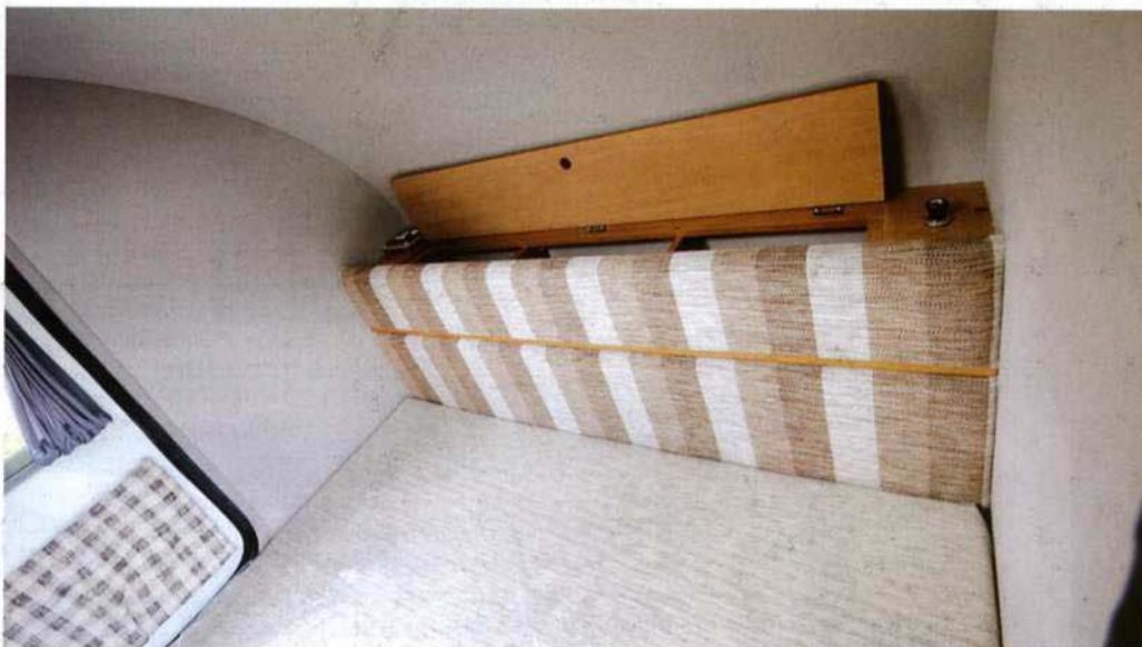
Padded headboard holds extra storage compartments.

What you also notice is the boomerang-shaped fin on the roof. It's not just for show though, as it is also an aerial with amplifier offering both FM radio and a TV signal. The unit inside is optional, but this allows