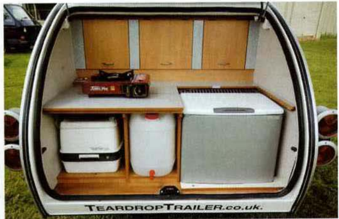
Compact as you'd expect but unusually all of the kit is provided.

As with most teardrop-type trailers that kitchen sits right in the tail and with this one most of the sloping rear panel rises, also on gas struts, to provide access to the cooking facilities. Unusually this one comes with all the kit; a 35-litre three-way fridge, a small